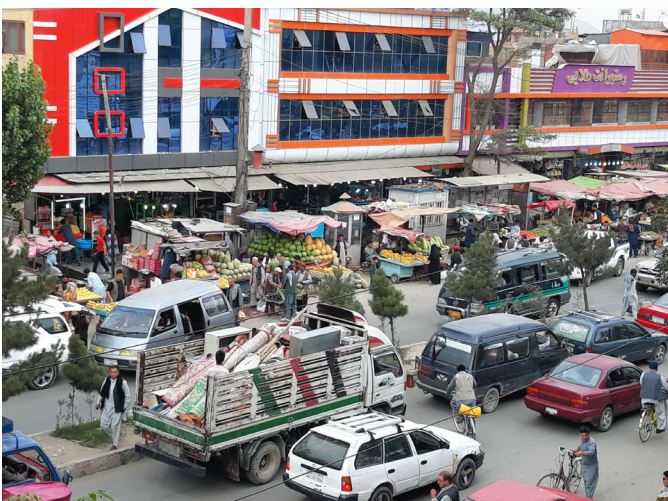
Photo: People busy with their daily routine amid COVID-19 pandemic in the city of Kabul.

Since COVID-19 contagion started, Afghanistan's health care system has continuously been facing countless challenges. The situation remains fragile due to many problems the country has been facing for a long period of time. The spread of the virus throughout the country has disproportionately affected the health system in ways where the burden continues to be a heavy load. The government has no other programs to help those who have lost their jobs, except providing needy families with