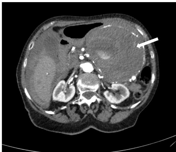
Fig 1. Computed tomography (CT) angiogram with the ruptured splenic artery aneurysm (SAA) and free fluid in the abdomen around the liver and in the fossa of Douglas.