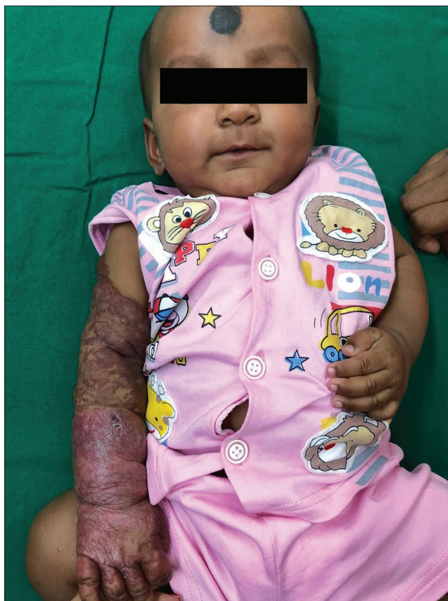
Figure 1: Marked hypertrophy of right upper limb compared to left upper limb with well demarcated red non blanchable patches and plaques with smooth surface extending upto the mid arm region