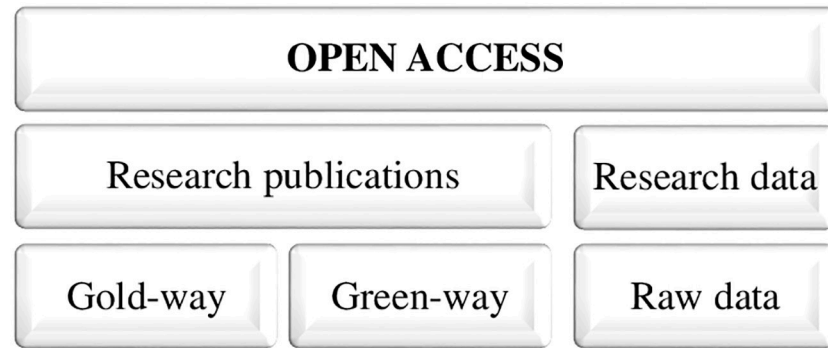
Fig 2. Open Access framework based on the European Commission.

https://doi.org/10.1371/journal.pone.0238801.g002