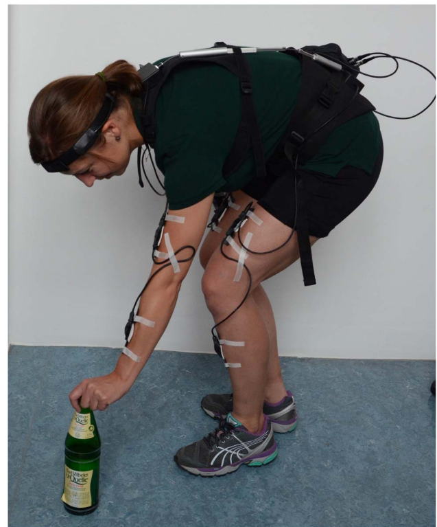
Figure 1 Illustration of the CUELA (computer-assisted acquisition and long-term analysis of musculoskeletal loads) system. Patient consent received.

Participants were observed in their day-to-day work to analyse the activities performed and the motions involved. A hand-held computer (UMPC Samsung Q1,