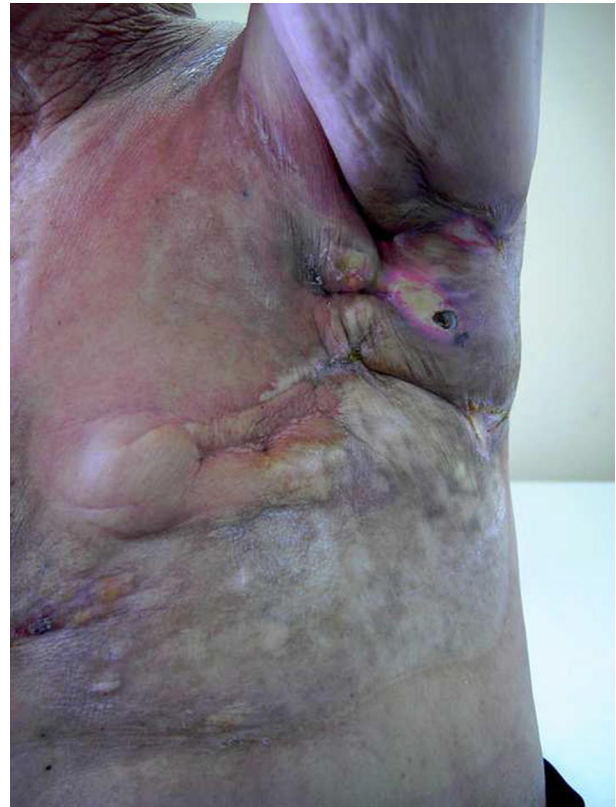
Figure 1. Recall dermatitis: anterolateral view of the thorax.

Tamoxifen treatment stabilized the patient's disease and serological response for four months. Afterwards, pleural progression was diagnosed and vinorelbine started with good response; after eight cycles, the patient suffered a new episode of skin toxicity that was managed with vinorelbine withdrawal and letrozole treatment, which allowed for a nine month stability period. In March 2012, progression was seen (liver metastasis and greater pleural effusion with clinical deterioration) and cyclophosphamide started. All active medication was stopped in May that year and palliative care lasted until the patient passed away a few months afterwards.