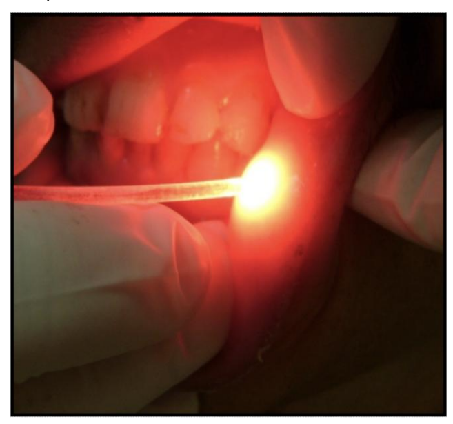
Figure 1: Minor aphthous lesion during phototherapy using diode laser 660 nm

consisting of a 10-cm horizontal line starting with a pole of no pain to reach the end pole presenting the unbearable pain [15]. Individuals were requested to mark the point on the horizontal line that best signifies their pain level.