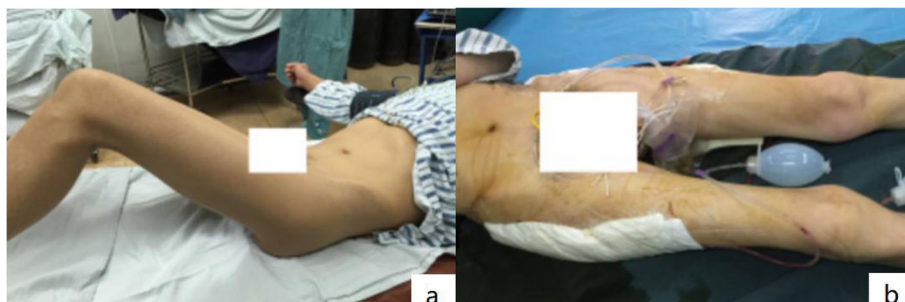
Fig. 2 a The perioperative photo showed that the patient flexion deformity bilateral hips were over 45°. b The postoperative photo showed that the hip straightening was achieved immediately

According to Kawamura [9], the assessment criteria for acetabular prosthesis loosening are as follows: stable fixation, no displacement of acetabular prosthesis, and no line of illumination; stable fiber fixation, no displacement of acetabular prosthesis, and presence of light line < 1 mm; suspected loosening, no displacement of