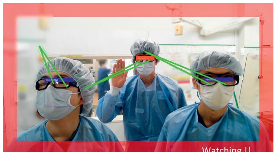
► Fig. 2 Detection of direct lines of sight to the fluoroscopy monitor displayed on the detection monitor.

time during endoscopic procedures (► Fig. 3). Radiation exposure could thus be minimized by detecting line of sight during actual endoscopy (► Video 1). This AI-based eye-tracking system is a promising tool to reduce radiation exposure time of patients and operators during fluoroscopic endoscopy procedures.