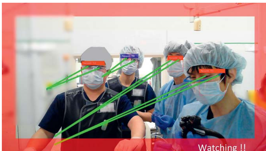
► Fig. 3 The eye-tracking fluoroscopy system during actual endoscopy.