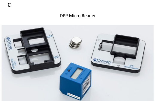
c. The DPP Micro Reader (middle) is positioned over the cassette holders (left, right) to read the lines of each test cassette. Text scans across the small screen on the Micro Reader to display the results of each test line. The Micro Reader is battery-powered. The Micro Reader can also be connected to a laptop, making it easier to read multiple results. The use of the logo was authorized by written permission from ChemBio Diagnostics.