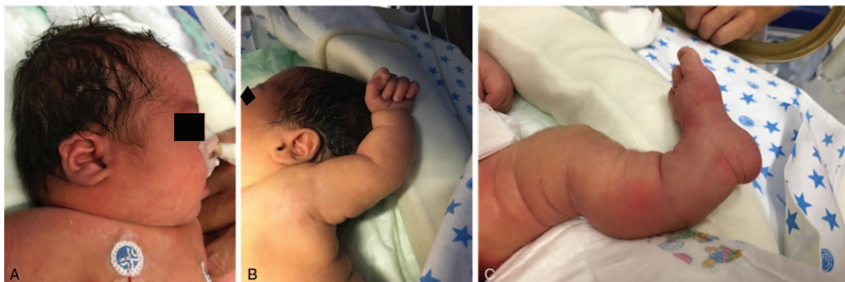
Figure 1. (A) Extreme short neck is showed. (B, C) Pictures of the neonate showing profound deformities and accordion-like skinfolds, explained by no underlying bone mineralization.

Based on clinical data, the suspected diagnosis was severe perinatal HPP. The data were confirmed by biochemical determination of plasma pyridoxal 5'-phosphate (PLP) levels (>200 nmol/L; normal reference range 23–172 nmol/L) and phosphoethanolamine levels in urine (7567 μmol/g, normal reference below 150 μmol/g). With these data, on the 3rd day treatment with ERT asfotase alfa (approved by EMA in 2015) was indicated obtaining parental informed consent. However, some hours later, the patient died of severe respiratory insufficiency secondary to thoracic hypoplasia.