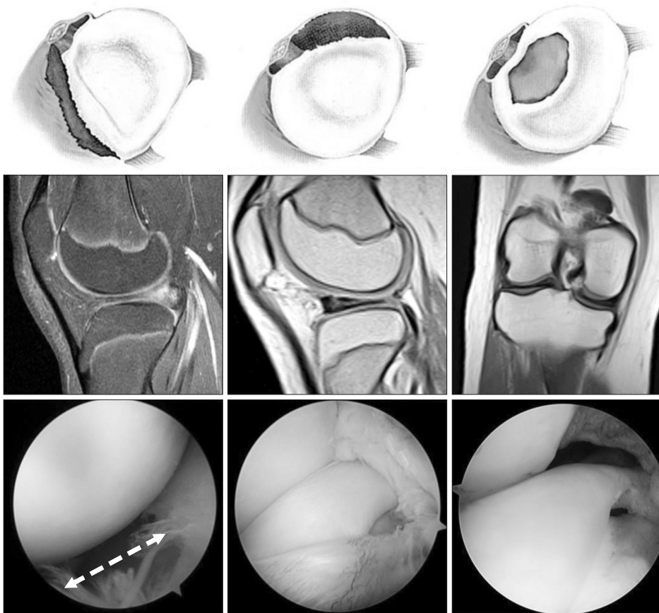
Fig. 2. Magnetic resonance imaging findings and arthroscopic views of the discoid meniscus according to the corresponding tear pattern. A peripheral tear refers to a longitudinal tear in the meniscocapsular junction area, anterior horn (posterocentral shift, left column), and posterior horn (anterocentral shift, middle column). The white dotted arrow (bottom, left column) shows the wide gap between the anterolateral border of the meniscus and the joint capsule. Posterolateral corner loss refers to the absence of the posterolateral portion of the discoid meniscus due to degenerative tears around the popliteal hiatus (central shift).

Snapping knee syndrome, in which a clunk is heard at the end of flexion, is usually related to an unstable meniscus variant, such as the Wrisberg type 35,36 . In very young children (range, 3 to 4 years), snapping is often asymptomatic, whereas older children (range, 8 to 10 years) more commonly experience pain with activity 37 . In addition, the older child may present with more acute symptoms than younger children 28 . The most common tear pattern of the discoid meniscus is a horizontal tear 30,38-40 . Repetitive microtrauma to the abnormal collagen arrangement is thought to cause horizontal tears after mucoid degeneration 9,41 .