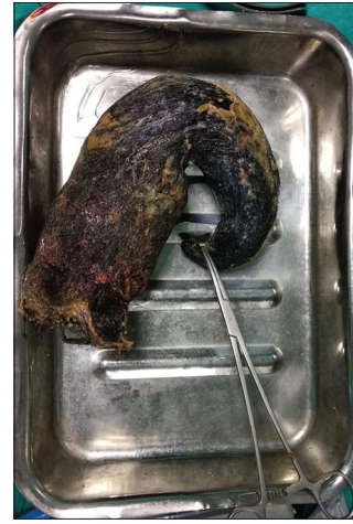
Figure 2: Removed trichobezoar

On psychiatric evaluation, patient reported history of eating hair since childhood. She would keep hair in mouth when stressed but would not realize that she was swallowing the hair too. Parents made her aware about her hair eating behavior when she was around 6 years old. This behavior would increase whenever she was scolded or had an argument with her family. She also provided history of fainting always following stress without any associated injury, tongue bite or urinary incontinence; weakness and; off and on mood symptoms