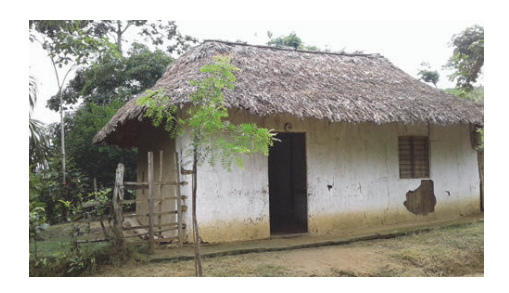
FIGURE 3: Patient's house infrastructure and peridomicile.