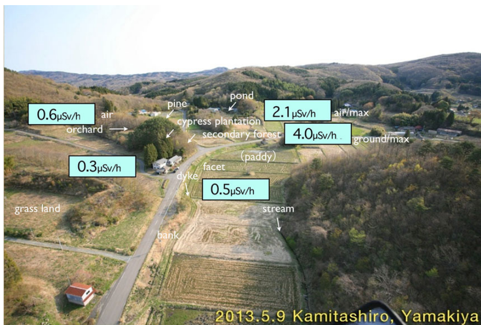
Fig. 2. Landscape and representative microhabitat dose rates at Kamitashiro, Yamakiya, Kawamata town, ~29 km northwest of the F1NPP. The aerial dose rates were measured with glass dosimeter badges (type ES, Chiyoda Technol. Ltd, Tokyo). This photo was taken using a motor paraglider, at several hundred meters above the ground (Bizworks Corp. Inc., Niiza). Typical dose measurement results and microhabitats are indicated in the picture: for example, the minimum and maximum values on the ground, and those close to the average value in air and in several types of forest, agricultural and water environments.