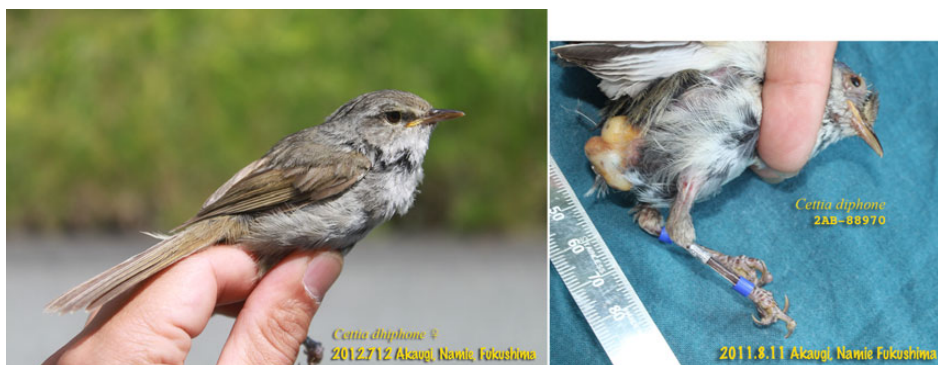
Fig. 3. A male Japanese Bush Warbler (left) and the lesion observed around the upper tail coverts on a male captured at Akaugi on 11 August 2011 [8].

in the Akaugi district, where the air dose rates were 20–30 \mu\text{Sv/h} (Fig. 3) [8]. The radioactivity of ^{134}\text{Cs} and ^{137}\text{Cs} was estimated to be above 3000 \text{kBq/m}^2 at Akaugi and above 1000 \text{kBq/m}^2 at Tsumima (where the birds were captured) [3]. The contamination of tail feathers (rectrices) collected from the three warblers from Akaugi were rated as high (Fig. 4, Bird 1, 1.2 Bq of ^{134}\text{Cs} and 1.8 Bq of ^{137}\text{Cs} for 0.015 g feathers; Bird 2, 2.5 Bq of ^{134}\text{Cs} and 3.6 Bq of ^{137}\text{Cs} for 0.026 g feathers; Bird 3, 12.5 Bq of ^{134}\text{Cs} , 17.3 Bq of ^{137}\text{Cs} and 1.4 Bq of ^{110\text{m}}\text{Ag} for 0.056 g feathers) [8]; these measurements were determined with a germanium semiconductor detector at the University of Tokyo. The total feather dose rates were calculated as 117–557 Bq/g for the three birds. The radioactive material on the feather was strongly fixed, and most of it could not be removed by washing with