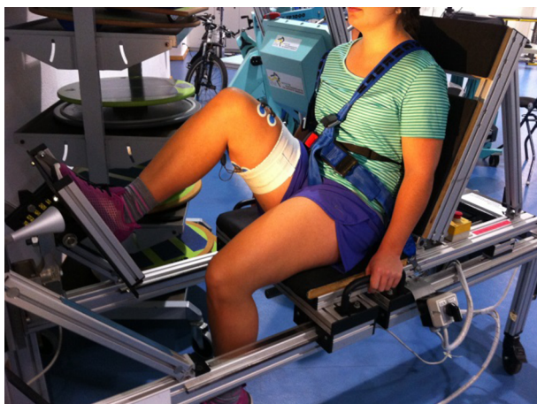
Figure 2 Isometric leg strength test.