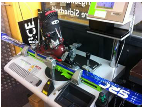
Figure 1 Wintersteiger Speedtronic – ski binding adjustment system.

Data are presented as means and absolute and relative frequencies. Differences in ski binding release frequencies