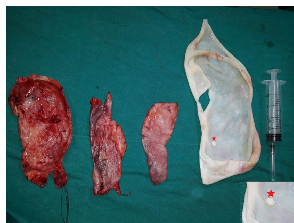
Fig. 2 Postoperative surgical image; germinal membrane (right) with a daughter cyst is depicted in the insert (star, right) and parts of the cystic wall (left)

disease. A transabdominal retroperitoneal approach through a subcostal incision was planned, with the aim of organ preservation. During the exploration, a large cystic structure was found to arise from the middle and the upper pole of the left kidney. After sucking the inner cyst fluid, we strongly suspected a hydatid disease; therefore, the operation field was protected with swabs soaked in 20% hypertonic saline. The cyst was opened and contents were evacuated, and 20% hypertonic saline was instilled as a scolicidal agent owing to