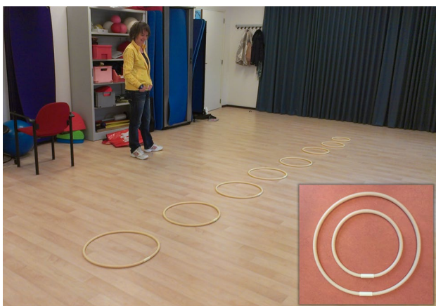
Fig. 1 Setting in which hoop training takes place, the insert bottom right shows two hoops in close-up

The insert at the right bottom of Fig. 1 shows a close-up of two different hoops. As can be seen the hoops look like traditional hula hoops. They are similar in weight (light, not comparable to fitness hula hoops), they just differ in size and production material. The hoops are made of flexible plastic tubing that is generally used to run electric cords through. Unlike traditional hula hoops, the hoops used in the training are flexible and can change shape from round to oval, which allows a patient to literally squeeze through the hoop if she wants. When standing in front of the eight hoops the patient is instructed to choose the one hoop that she perceives to fit her body exactly. After choosing a hoop the patient is asked to step inside that hoop and lift it up, over her head. The therapist has a coaching role, and stresses that the aim of the training is not to immediately select the best-fitting hoop, nor to be able to fit into the most-desired hoop, but to be able to practice with judging what the body can and cannot do. In this case, where it can and cannot fit through. In each session the patient is allowed to choose a hoop twice. This