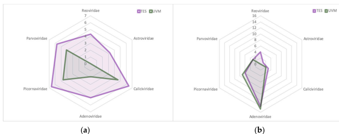
Figure 3. Comparison of the number of viral reads (a) and contigs (b) from families with members related to gastroenteritis with Target Enrichment Sequencing (TES) and Untargeted Viral Metagenomics (UVM) in the F1-3A pool. The number of reads is represented as log 10 .

Comparing both methodologies and focusing on viral families of interest regarding gastroenteritis etiology, TES enabled the detection of a larger number of viral reads (Figure 3a), allowing the detection of Reoviridae members, which were not detected with the UVM approach. Additionally, TES allowed the typing of the hexon, penton and fiber genes of a HAdV-31 that could not be typed by UVM. In contrast, when analyzing these reads as contigs, the differences were reduced to obtain the same number of contigs by applying both methodologies to the detected families (Figure 3b). This observation could be related to the sequence fragmentation and diversity of the sample, the absence of sequences from different regions of each viral assignment, or the absence of regions to which the probes are hybridizing. This phenomenon would result in a large number of reads from the same genome region and a reduction of diversity, but an increase in accuracy of the contig sequence.