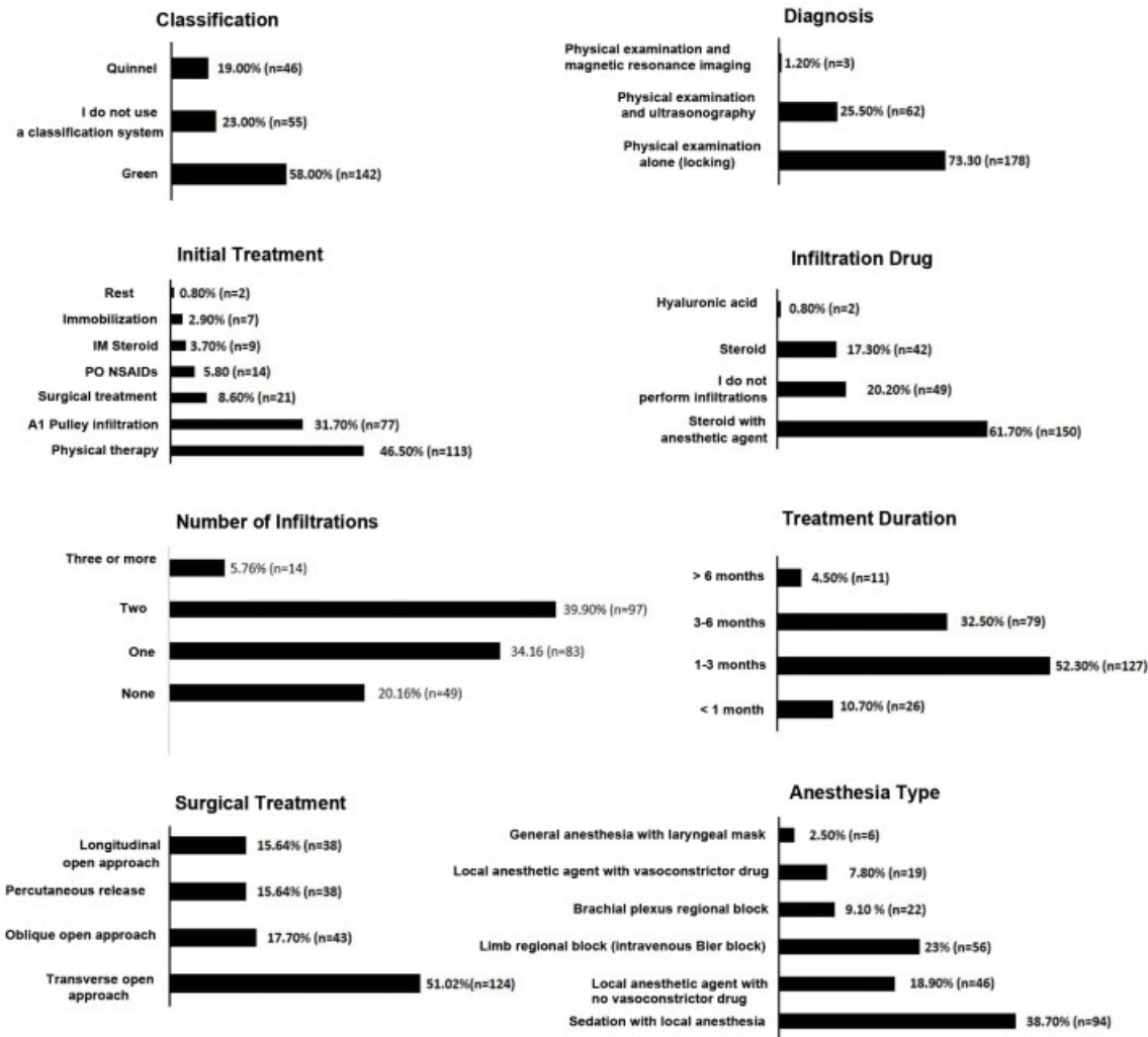
Fig. 1 Diagnosis and treatment of trigger finger. Abbreviations: IM, Intramuscular route; NSAIDs, non-steroidal anti-inflammatory drugs; PO, oral route.

success rate ranging from 30 to 60% for nonsurgical treatment; triggering recurrence was the most frequently reported complication (58.0%; n = 140 ). Percutaneous surgery had a success rate ranging from 60 to 90% for 43.0% ( n = 104 ) of the respondents, and its most common complication was triggering recurrence (48.0%; n = 117 ). In contrast, open surgery had a success rate > 90.0% for 63.0% ( n = 154 ) of the respondents, with healing interurrences (54.0%; n = 130 ) as the most frequently reported complication (► Figure 2 ).