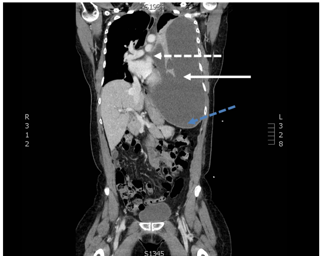
FIGURE 1: A coronal slice of a contrasted computed tomography of the chest, abdomen, and pelvis demonstrating a large left-sided pleural effusion (solid white line) with mass effect on the mediastinum (dashed white line) and left hemidiaphragm (dashed blue line)

pressure of 69/50 mmHg, temperature of 101.1° Fahrenheit, and pulse oximetry of 95% on room air. The patient's physical exam was remarkable for conjunctival pallor, decreased breath sounds, and dullness to percussion on the patient's right posterior lung fields. Intravenous access was established, and the patient received one unit of fresh whole blood followed by 2 liters of lactated Ringer's solution and 1 gram of cefepime. The patient's blood pressure and heart rate improved to 110/60 mmHg and 110 bpm, respectively. A subsequent contrasted CT of the chest, abdomen, and pelvis demonstrated a large left pleural effusion causing a nearly complete collapse of the left upper and lower lung. Mass effect was also noted, to include a rightwards mediastinal shift and a downwards left hemidiaphragm shift displacing the spleen and left kidney inferiorly (Figures 1-2). Serum studies revealed 350 white blood cells per mm of blood, 35 neutrophils per mm of blood, and a platelet count of 17,000. The patient was administered six units of platelets and admitted to the medical intensive care unit (MICU) where 2 liters of sanguineous pleural fluid were drained with thoracentesis.