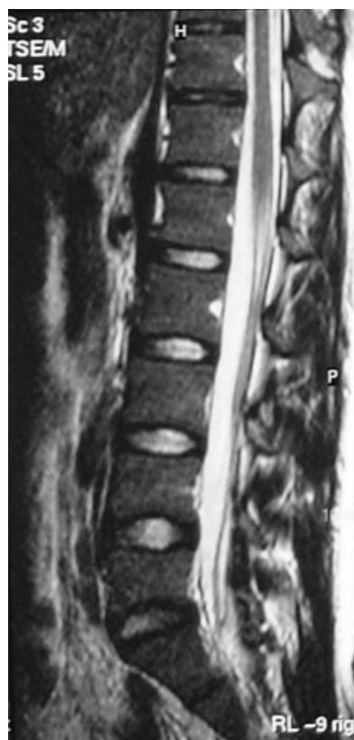
Figure 2 Preoperative T2-weighted sagittal magnetic resonance imaging showing no sign of slip or disc degeneration.

the two edges of lytic defects to facilitate fusion, and we tightened the nuts under compression. We used caution in order not to derange the apophyseal joint capsules. The total time of surgery was 3.5 hours with ~75 mL of blood loss.