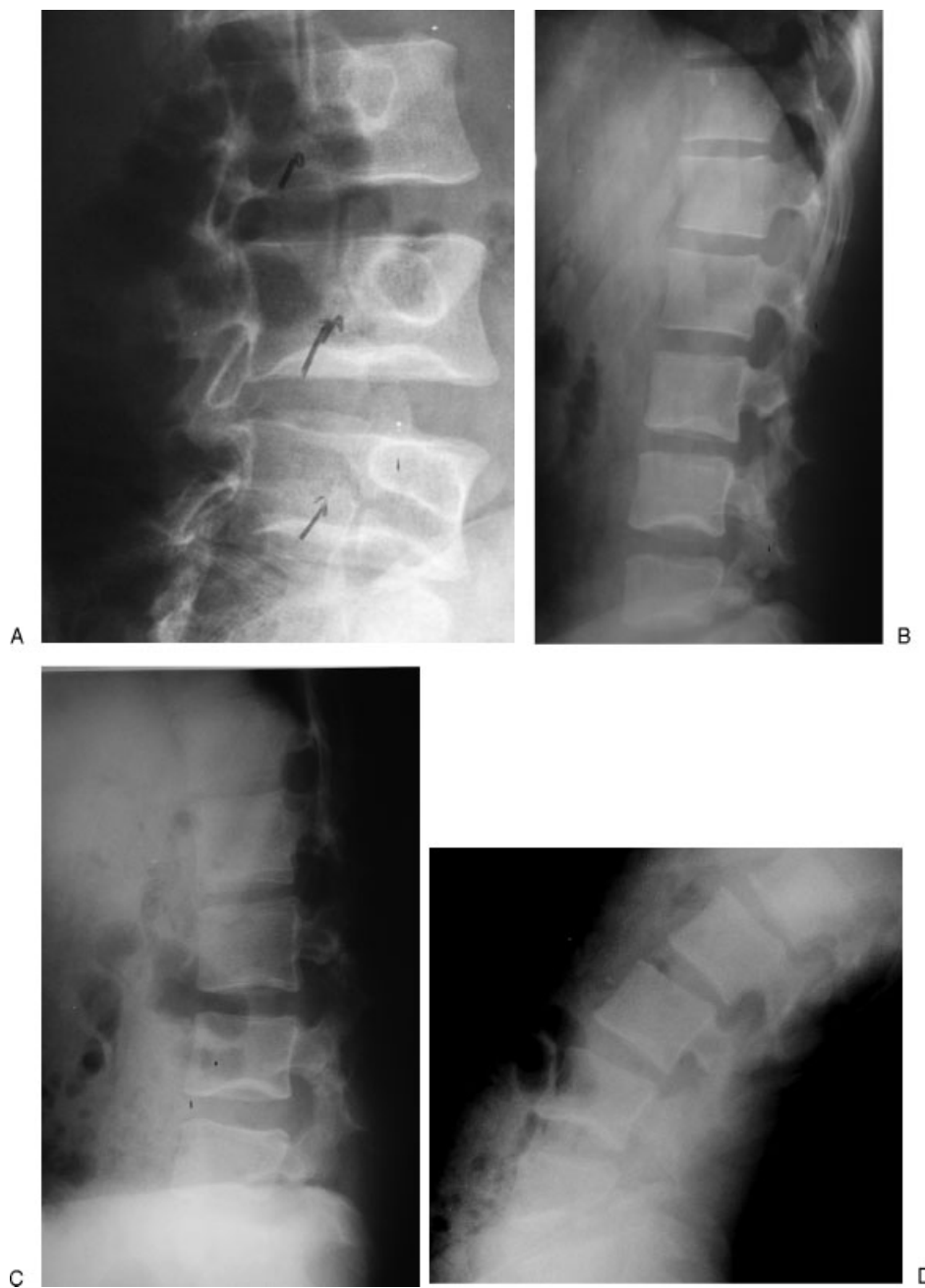
Figure 1 Preoperative plain X-ray showing three-level bilateral spondylolysis: right oblique (A), lateral (B), flexion (C), and extension (D) views.

A 3-month course of conservative treatment with nonsteroidal anti-inflammatory drugs was suggested, along with physical therapy and lumbar soft corset. The patient was symptomless after treatment, but 4 months later he again complained of a similar problem. The pain became more and more severe so that conventional conservative therapy had minimal effect and even referral to pain clinics and injection of anesthetics were unsuccessful in achieving acceptable and permanent results. The severity of pain disabled the patient. To prove the origin of the pain, with the guidance of fluoroscopy, local anesthesia (i.e., lidocaine and bupivacaine) was injected around all pars interarticularis defects. Again, the pain was relieved for 2 days, which reinforced the theory that the source of patient's pain was the spondylolysis. We were