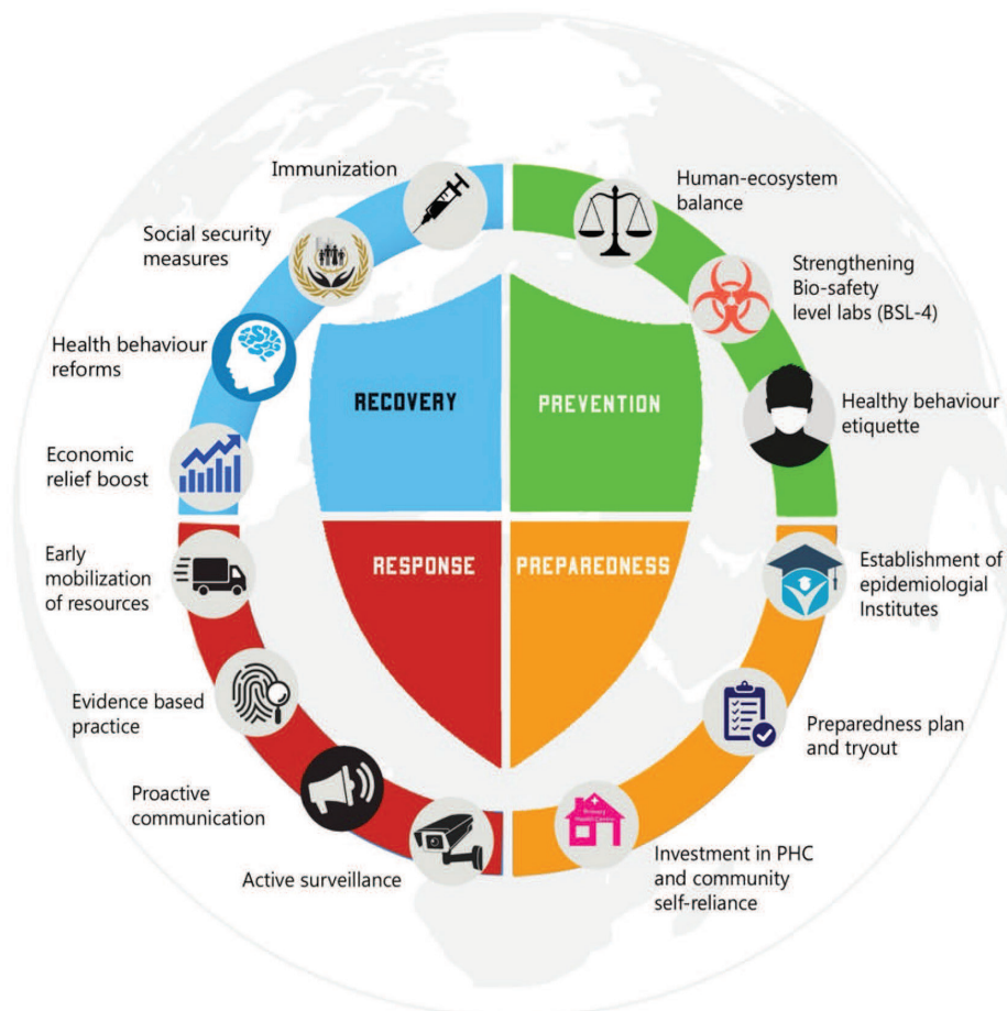
Figure 3. Global strategic model for future pandemics. PHC, primary health center.

During the preparedness phase, epidemiological institutes should be built, which could help with the swift identification of a virus and its characteristics. It is imperative for every nation to have tailored pandemic preparedness plans, and the plans should be tried out during inter-pandemic periods to evaluate their efficiency and flaws. As primary health centers (PHCs) remain the initial contact between patients and the health care system, PHCs should be