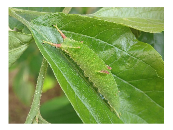
Figure 1. Last instar larva of Hestina japonica.

conducted to reveal natural enemies of H. japonica larvae. In the second experiment, we examined whether the larvae effectively defend themselves against the attack of Polistes wasps, the primary natural enemies of H. japonica larvae, by using their horns as a physical shield.