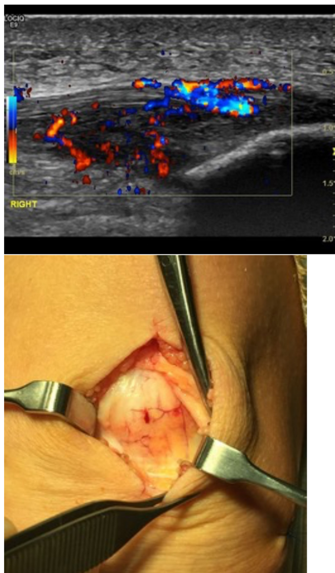
Figure 1 Blood vessels on superficial proximal patellar tendon.

participants with persistent painful patellar tendinopathy. Clinical status and function using the VISA-P, and tendon structure using UTC, was used for evaluation.