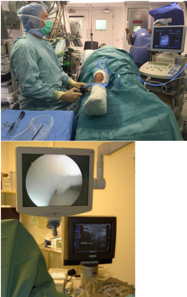
Figure 2 Surgical patellar tendon debridement procedure using ultrasound guidance.

a vertical longitudinal incision in the skin and bursa, the locally thickened paratenon was visualised (see figure 1 ). The richly vascularised fatty infiltration located under the paratenon on the superficial side of the tendon was carefully excised until normal underlying tendon tissue was visualised. Careful haemostasis was achieved. Resorbable sutures were used subcutaneously, and non-resorbable sutures were used for the skin. Local compression was applied.