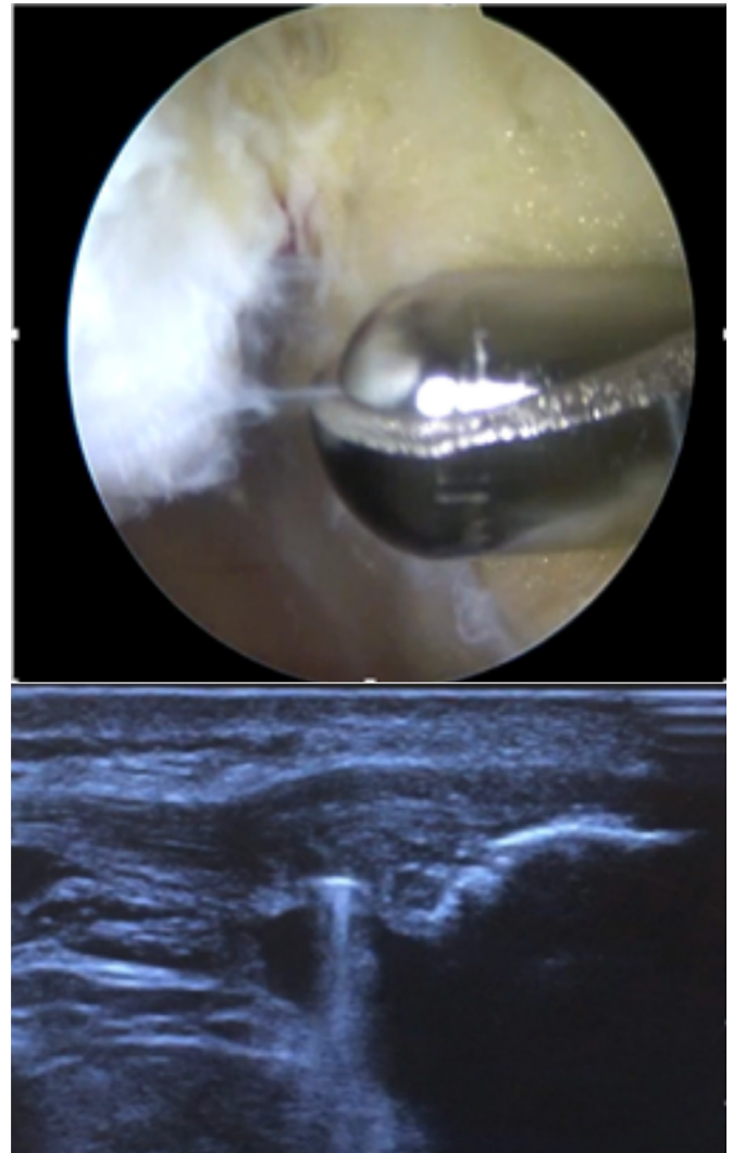
Figure 3 Arthroscopic patellar tendon debridement using ultrasound guidance.

Participants rested overnight and allowed to partially weight-bear with crutches. All participants were reviewed the next day. If a knee joint effusion was present, an aspiration was performed under US-guidance using strict sterile conditions. In the absence of any postoperative complications such as a major superficial haematoma, rehabilitation was started using a specific postoperative rehabilitation plan ( table 1 ). The general rehabilitation principles were derived from an expert consensus statement on rehabilitation of patellar tendinopathy, 7 but there was often a need to individualise the programme dependent on the functional requirements of the participants. Sutures were removed at 3 weeks. All participants