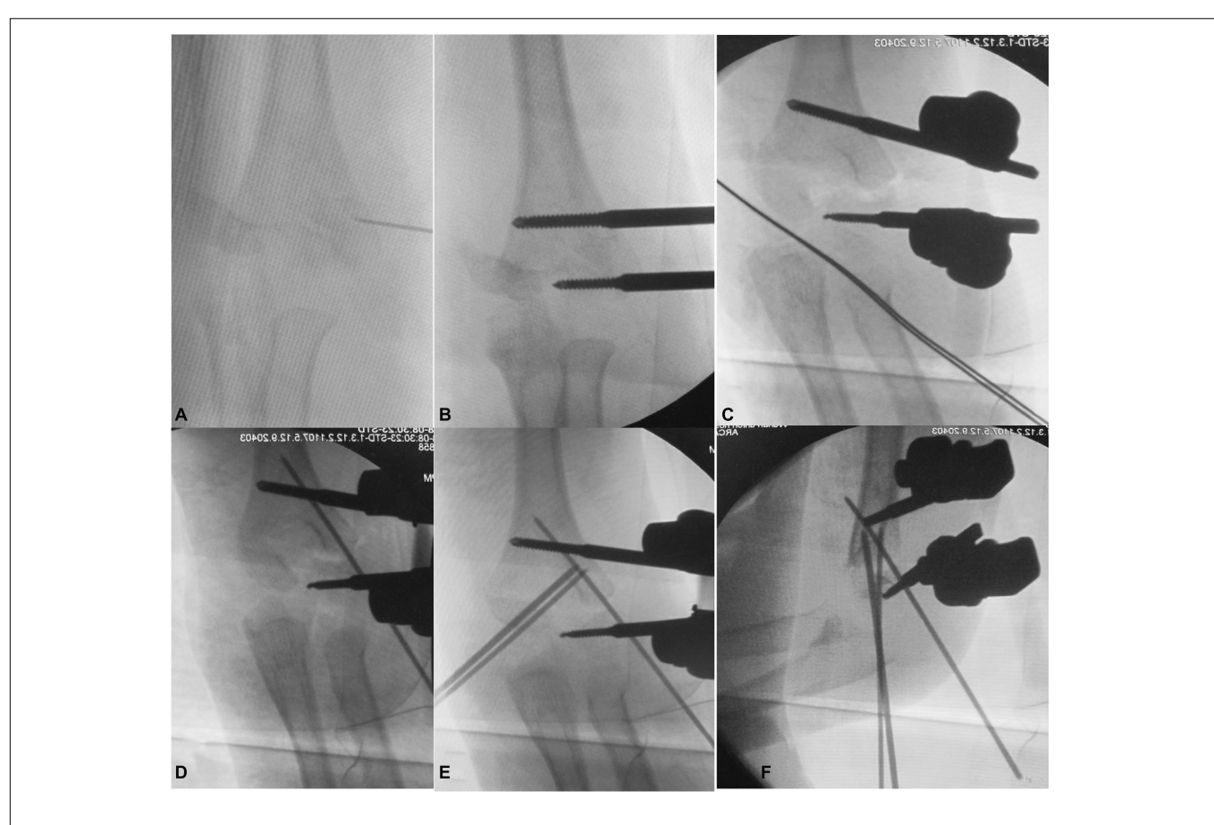
FIGURE 2 | The C-arm x-ray during operation showed: (A) the distal lateral condyle fragment located with a syringe needle; (B) placement of radial unilateral external fixation; (C) reset the lateral side of the distal humerus by closed reduction and tightened external fixation; (D) placement of the radial side anti-rotation K-wire to stable the lateral fragment; (E) placement of the ulnar K-wire to stable the medial fragment; (F) lateral view of the elbow after fixation.

humerus are rare in children (21). A CT scan plays a significant role in the surgical plan in such a fracture pattern.