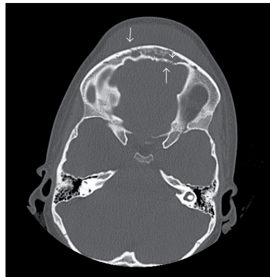
FIGURE 3: Axial CT without contrast on presentation demonstrating erosion of the anterior and posterior tables of the frontal sinus (arrows), frontal sinus opacification (arrowhead), and soft tissue swelling of the forehead.

drained forehead and intracranial abscesses. To address the sinus disease, we utilized image guidance to create a left nasal antral window, bilateral frontal sinusotomies, anterior ethmoidectomies, and uncinectomies. Purulent fluid was obtained from the left middle meatus, left maxillary sinus, and left ethmoid bulla. Specimens were sent for gram stain, aerobic, anaerobic, fungal, and acid-fast cultures.