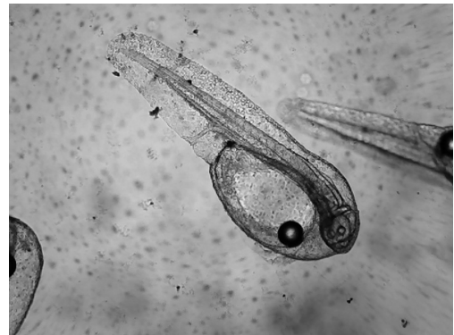
Fig. 3. Hybrid fish ( E. akaara ♀ \times E. lanceolatus ♂ (cryopreserved sperm)) at 1 day post hatching.

sperm cryopreservation technology for the giant grouper may make crossbreeding possible and break through the reproductive isolation caused by temporal and geographic isolation.