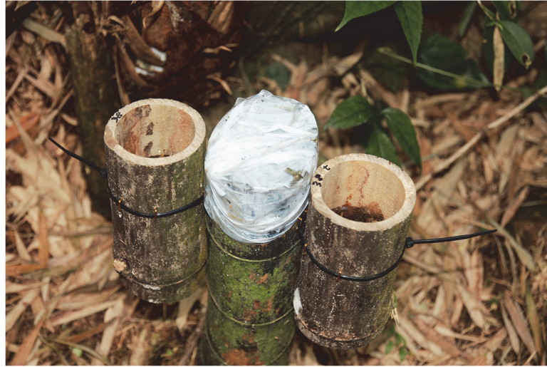
Fig 1. A set-up for a manipulated experiment on nest choice. Paired bamboo cups were attached to a stump which was covered by a plastic sheet.