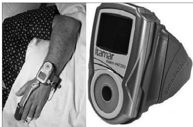
Figure 1: Watch PAT 200

It allows patients to sleep in the comfort of their own bed and simple and easy to wear.