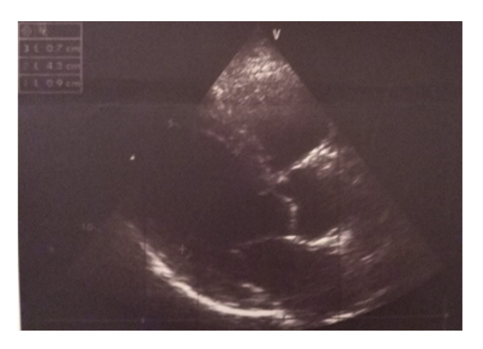
Fig. 2. The transthoracic echocardiography (parasternal long-axis view) of a 62-years-old woman with psoriatic arthritis revealing mild thickened aortic and mitral valve.

The most commonly recognized cardiac manifestation of SpA is aortic valve disease, which is usually restricted to the ascending aorta and aortic arch, and includes aortic regurgitation (AR), aortic valve thickening (AVT) and aortitis [6]. Its prevalence increases with age and is especially related to the disease duration [22-24]. In our study, the prevalence of aortic involvements was distributed as follows: 3 (3.3%) had AR, 1 (1.1%) had aortic dilatation and 1 (1.1%) had AVT. These results were in