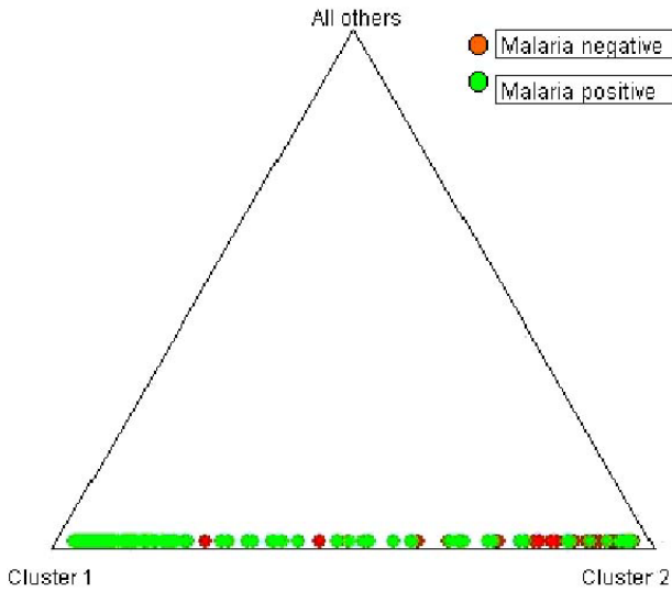
Figure 1 Triangle plot showing estimates of membership coefficient (Q) for each individual by sampled groups, analysed under admixture model, assuming correlated allele frequencies.