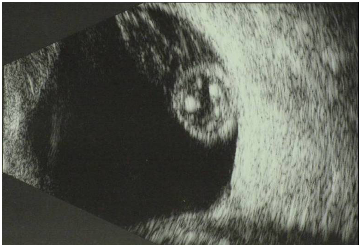
Figure 1 Ocular ultrasound of the left eye demonstrating the dislocated lens in the vitreous cavity. Ocular ultrasound of the left eye at presentation demonstrating the dislocated lens (heterogeneous hyperechogenic oval-shaped mass) within the vitreous cavity (hypoechoic).

the option for surgical treatment with a glaucoma drainage device (GDD) was brought up. The risks and benefits of surgery to her left eye were discussed at length. In addition to the ocular risks, the anaesthetic risks associated with Marfan syndrome were also discussed. She agreed, and was listed for left Baerveldt implant insertion under general anaesthetic.