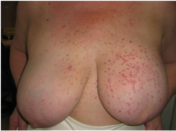
Figure 1: Rash on the left breast, left submammary area and medial right breast, composed of multiple monomorphic erythematous macules.

activating KIT D816V mutation, a mutation which is found in the majority of patients with SM.