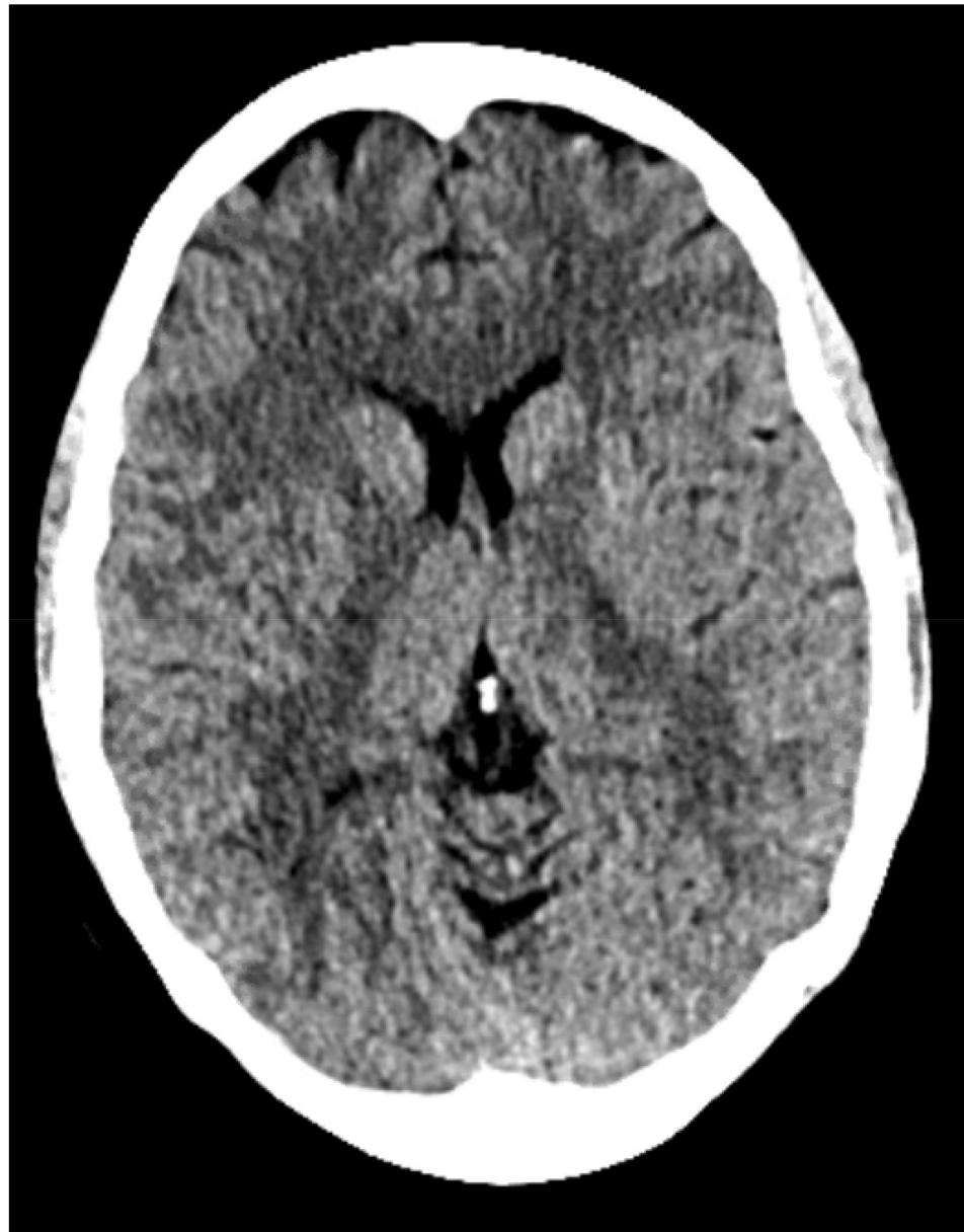
Figure 1. CT brain non-contrast performed after presentation for suspected CSF leak confirming no pneumocephalus.

Prior to discharge, each patient was evaluated to confirm cessation of their leak and subsequently discharged with strict instructions again to avoid Valsalva maneuvers and strenuous activity, given two weeks of stool softeners, and asked to maintain elevation of the head of their bed for two weeks. These patients were followed up in clinic by otolaryngology and neurosurgery to assess for the presence of CSF leak at two and four weeks, post-operatively. Clinical information was collected retrospectively.