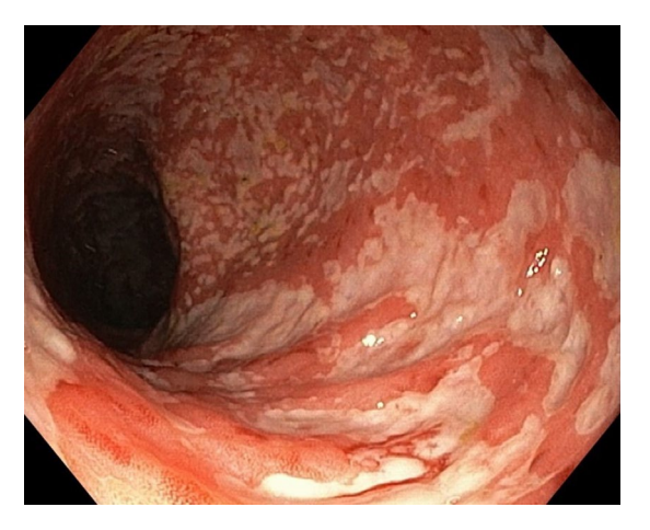
Figure 2. Endoscopic finding of a severe immune checkpoint inhibitor colitis with large ulcers and mucosal erythema.

patients that are under anti-PD-1 antibody monotherapy.50 If nivolumab and ipilimumab are administered in a combinatorial treatment, the incidence increases up to 44%.<sup>51</sup> Colitis, another common irAE, is defined as (bloody) diarrhea with either abdominal complaints or the evidence of inflammatory stigmata in radiographic imaging.52 Depending on the severity, treatment options vary from antidiarrheal drugs to systemic glucocorticoids and discontinuation of the ICI.53 An exemplarily endoscopic picture of an ICI colitis is displayed in Figure 2. As described previously, other causes of diarrhea and colitis, such as infectious diseases, must be excluded. Intriguingly, diarrhea and colitis typically occur 6 weeks after the first ICI administration and are more frequent with anti-CTLA-4 antibody immunotherapy.54 A consensus about the role of the computed tomography (CT) scan in the diagnosis of colitis has not been found yet and is the matter of current debates. If the diagnosis remains unclear (after a CT scan), the performance of a colonoscopy or sigmoidoscopy must be considered with high priority.46 Vomiting, epigastric pain and nausea are clinical symptoms that suggest upper gastrointestinal drug-mediated toxicity. They are less common than lower gastrointestinal toxicity, in which diarrhea is the most common symptom.55