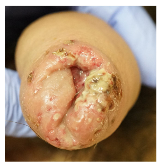
Fig. 1. Clinical picture at first visit. Local examination revealed a markedly swollen penile foreskin with exudation.