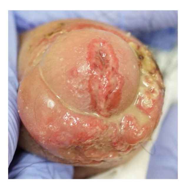
Fig. 2. Clinical picture at first visit (after peeling the foreskin). The inflamed penile foreskin was peeled off, and the collected purulence was sent for culture and sensitivity testing.

performed on the same day. As the patient was showing clinical improvement, the administration of amoxicillin (750 mg/day) was continued for 16 more days. The patient's symptoms gradually improved, and he recovered within a month of his initial visit.