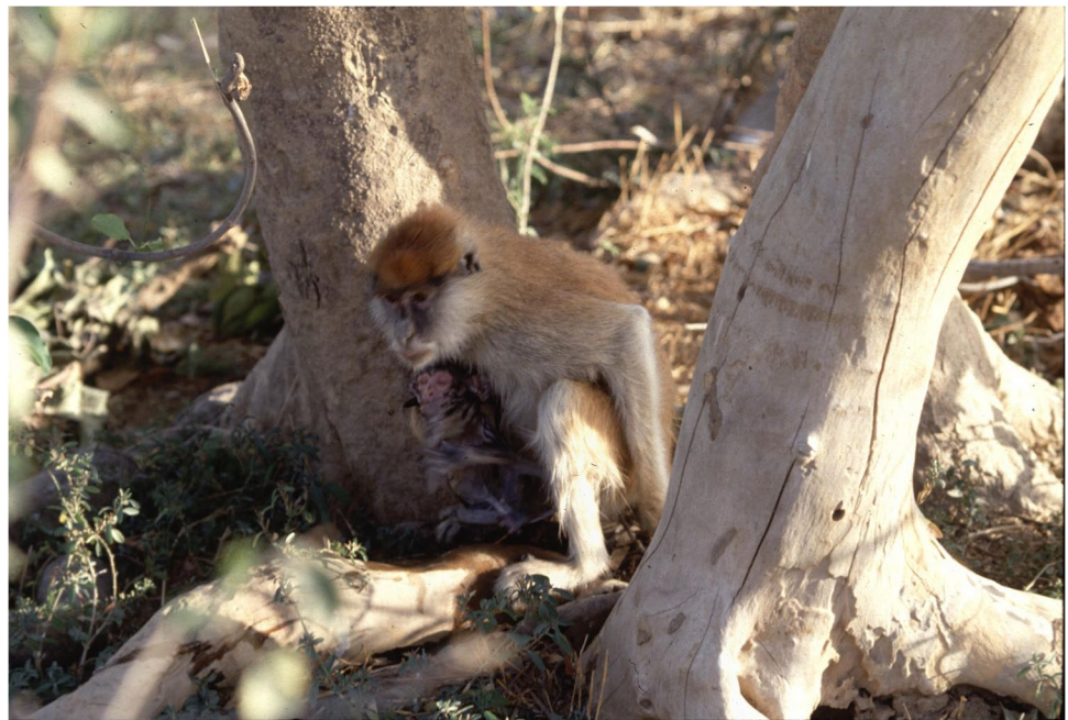
Fig. 1 Diurnal birth as a species-typical pattern of patas monkeys in Kala Maloue National Park, Cameroon (Nakagawa 1992, see also Chism et al. 1983)

N. Nakagawa: the president of the Primate Society of Japan, Associate Editor, PRIMATES.