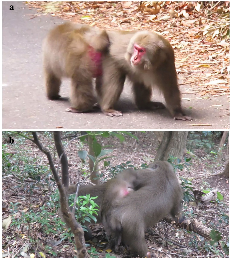
Fig. 4 a RR type of rump-rump contact between adult male Japanese macaques in Yakushima (snapshot of a video taken by Maho Hanzawa). b RT type of rump-rump contact between adult male Japanese macaques in Yakushima (snapshot of a video taken by Maho Hanzawa)