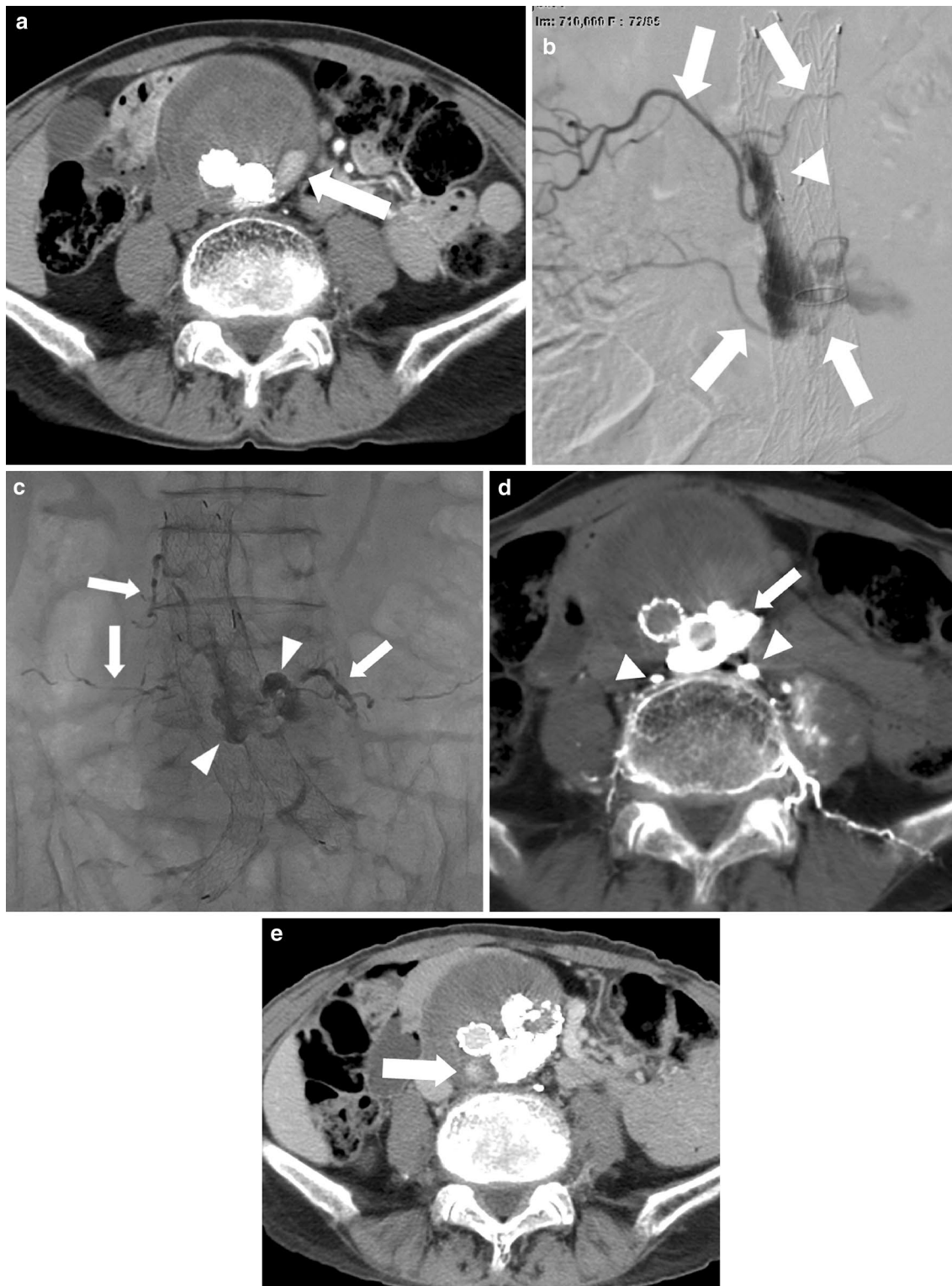
Fig. 1 Images of an 88-year-old man with T2EL (case no 1, Table 1). a Enhanced CT showed that the aneurysm expanded with persistence of T2EL (arrow) 15 months after EVAR. b Endoleak angiogram performed via a microcatheter demonstrated that the endoleak involved four vessels (arrows). Arrowhead indicates the micro catheter tip that was advanced into the endoleak sac through the left fourth lumbar artery. c Roentgenogram showed NBCA injected to fill simultaneously the aneurysmal sac (arrowheads) and the involved lumbar arteries (arrows). d Plain CT showed radio-paque NBCA accumulations in the endoleak sac (arrow) and lumbar arteries (arrowheads). e Enhanced CT obtained 6 months after the embolization showed another small endoleak (arrow) with no further expansion of the aneurysm