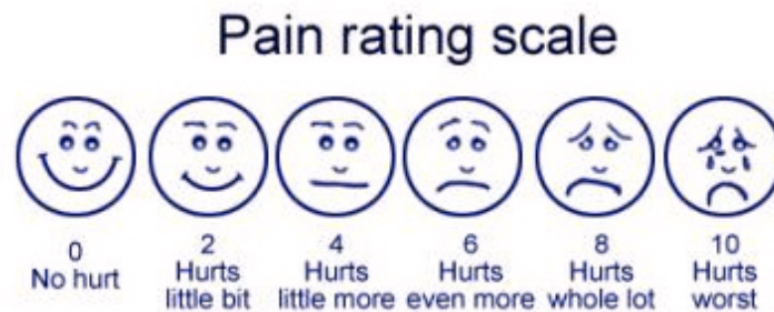
Figure 2. Example of a visual analog scale to measure pain. Participants are requested to rate their perceived pain choosing one of the six different options. No copyrighted figure.

Another example is offered by Hui et al. (2007), who investigated the effects of acupuncture stimulation in eliciting “deqi”, a composite of sensations interpreted as the flow of qi or ‘vital energy’ according to the traditional Chinese medicine. Their procedure was entirely based on IPAs and described as follows :” At the end of each tactile stimulation or acupuncture procedure, the subject was questioned by another researcher in the team if each of the deqi sensations (aching, pressure, soreness, heaviness, fullness, warmth, cooling, numbness, tingling, dull pain), sharp pain or any other