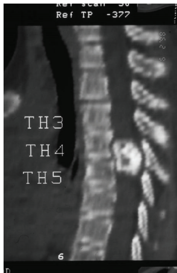
FIGURE 2: Reformatted sagittal CT scan showed a lesion arising from the T3-5 lamina and indenting the spinal cord (obliteration and stenosis of the spinal canal at the level of T3).

Recently, the patient developed pain and weakness in both lower limbs associated with urinary incontinence. Neurologic examination showed hyperreflexia, sustained clonus, Babinski sign, and decreased pinprick response to the level of the thigh in both legs. Conventional spine radiograph showed large cauliflower mass projecting along the anterolateral aspect of the spine (Figure 1). Reformatted sagittal CT scan showed a lesion arising from the T3-5 lamina and indenting the spinal cord (obliteration and stenosis of the spinal canal at the level of T3-5 (Figure 2). Axial CT of T3