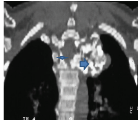
FIGURE 4: Coronal reformatted CT scan image showed a huge intraspinal mass with heterogeneous intensity. The ossified matrix is surrounded by cartilage tissue. The osseous tumour originating from the left T3-5 facet joint (arrows-arrow head is the pedicle and long arrow is the exostosis).

scan showed the extent of the involvement of the left lamina and compression of the cord. The cauliflower appearance corresponds to the ossified matrix of the osteochondroma (huge intraspinal mass with heterogeneous density). This ossified matrix is surrounded by cartilage tissue, the osseous tumour originating from the left T3-5 facet joint (arrows) (Figure 3). Coronal reformatted CT scan image showed a huge intraspinal mass with heterogeneous intensity. The ossified matrix is surrounded by cartilage tissue. The osseous tumour originating from the left T3-5 facet joint (arrows-arrow head is the pedicle and long arrow is the exostosis) (Figure 4). Our patient underwent posterior decompression of T3-5. At operation an encapsulated mass was found arising from the posterior elements of T3-5 and causing compression of the spinal cord. Histological examination confirmed a benign osteochondroma. Typically, the microscopic appearance of the cartilaginous cap was that of benign hyaline cartilage. The patient made a remarkable neurological