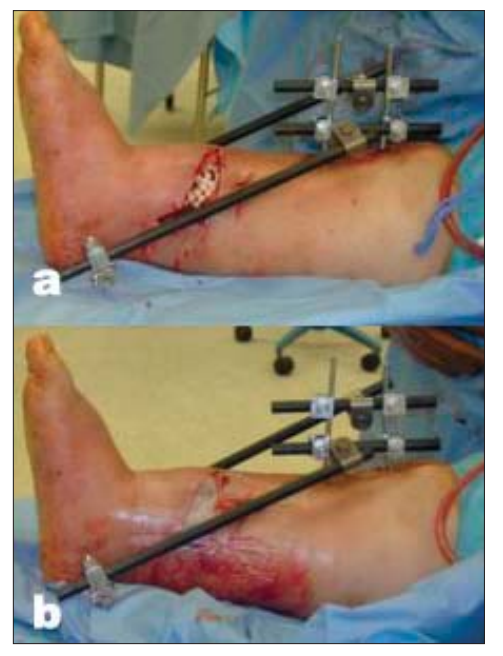
Figure 1: (a) Clinical photograph of a open fracture leg shows antibiotic bead pouch before occlusive dressing application. (b) Antibiotic bead pouch with occlusive dressing applied

0 to 2% for Type I fractures, 2 to 10% for Type II fractures, and 10 to 50% for Type III fractures.<sup>5,9,23</sup> More recent studies have shown that the rates of clinical infection increased to 1.4% (7/497) for Type I fractures, 3.6% (25/695) for Type II fractures, and to 22.7% (45/198) of Type III fractures.<sup>24</sup> These data are similar to a more recent study on the treatment of open tibia fractures.<sup>25</sup>