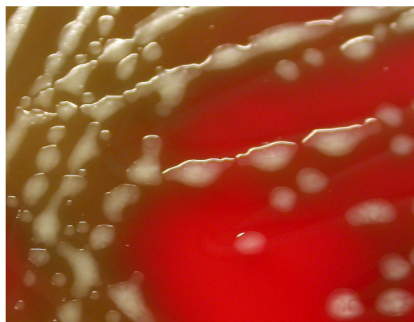
Figure 2 Mucooid S. pyogenes colonies on blood agar plates after overnight incubation under an atmosphere enriched with 5% CO 2 .

Twenty four out of 144 non-mucooid isolates analyzed in 2009, belonged to the emm3 type, which shared the same molecular and susceptibility characteristics ( emm3.1 /ST15) as the emm3 mucooid isolates, although belonged only to the PFGE pattern A. The remaining 120 non- emm3 non-mucooid isolates showed percentages of non-susceptibility in variable proportions (19.2% to erythromycin, 5.8% to clindamycin, 5.8% to tetracycline and 1.7% to levofloxacin). The only difference between emm3 non-mucooid and mucooid isolates was the degree of hyaluronate encapsulation.