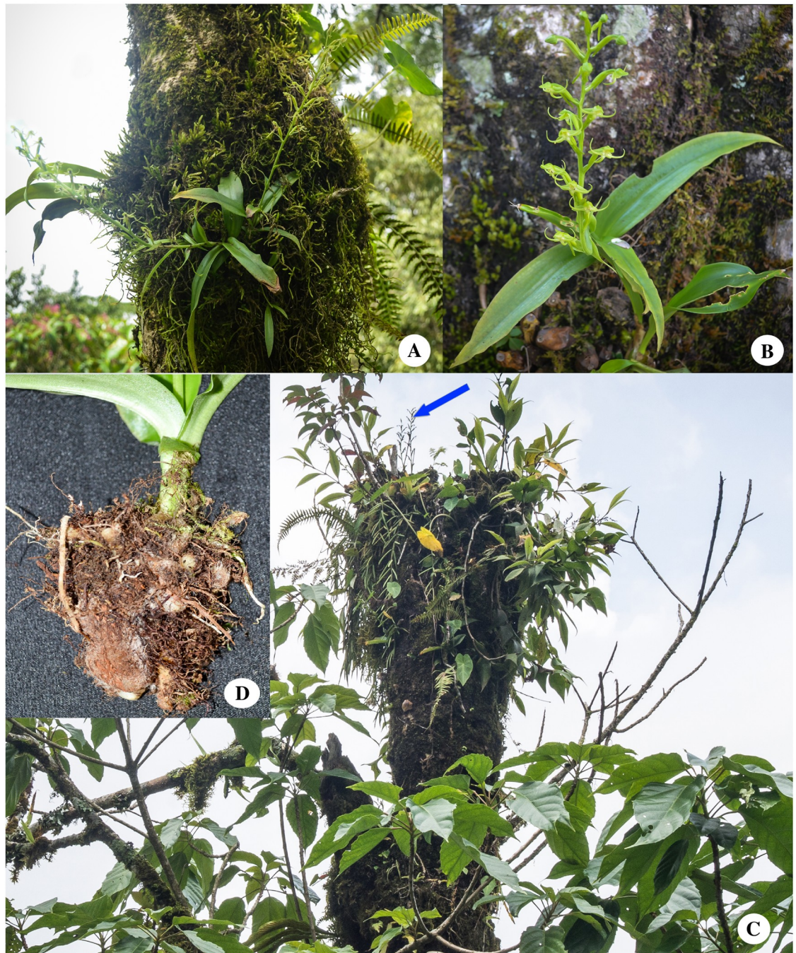
Fig 3. A, B, C, showing habitat and D, multiple growing callus like tubers of Habenaria sandiegoensis .

https://doi.org/10.1371/journal.pone.0223355.g003