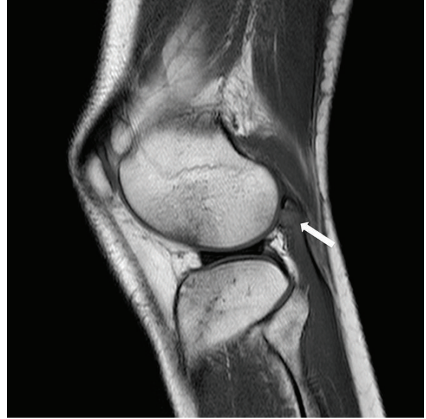
FIGURE 3: T1-weighted fast spin-echo MRI showed bone contusions in the anterior femoral and tibial regions at the lateral tibiofemoral compartment, related to hyperextension and valgus mechanisms of injury.

A conservative management strategy and symptomatic treatment for pain were adopted in the acute setting for this