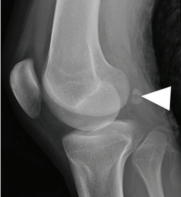
FIGURE 1: Lateral plain film of the left knee revealed a transverse radiolucent line with irregular borders across an ossified fabella (arrowheads) consistent with a complete fracture of the fabella.