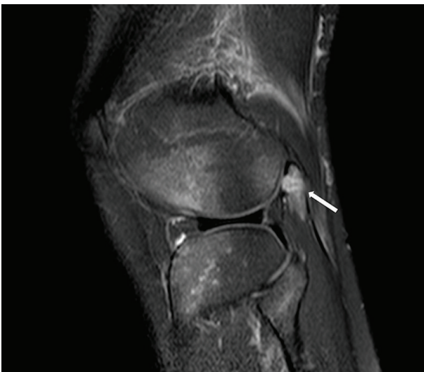
FIGURE 2: A sagittal T2-weighted fat-suppressed MRI demonstrated diffuse bone marrow edema pattern of the fabella (white arrow) associated with fracture seen on radiographs.

changes consistent with bone contusions at the femoral condyles, tibial plateau, and the fibular head were also detected. The avulsion fracture of the medial aspect of the medial femoral epicondyle, located close to the insertion of medial collateral ligament, was also confirmed. No other abnormalities were detected.