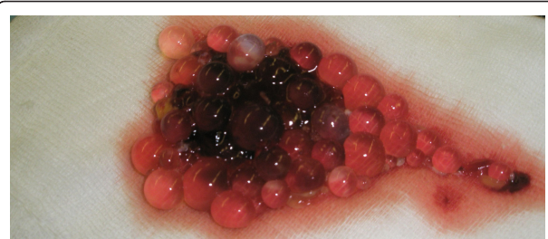
Figure 5 Contents of the cyst showing small, grape-sized vesicles.

if the primary lesion is in muscle - 0% [8]. If muscles or bones are affected the most commonly used therapeutic regimen is radical surgical excision combined with adjuvant pre- and postoperative chemical therapy. Mebendazole has been the agent of choice historically, for adjuvant chemotherapy. Although no data exists on chemotherapy in musculoskeletal echinococcosis, in patients having intraabdominal pathology, albendazole, especially in combination with praziquantel has proven to be more effective in achieving high serum and cyst fluid levels of albendazole sulphoxide [9].