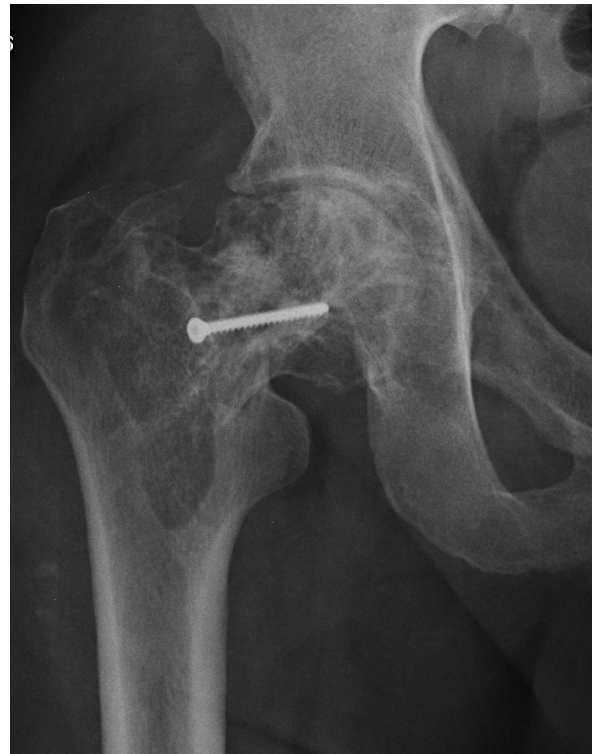
Figure 3 AP radiograph of the right hip showing a basicervical femoral fracture.

lateralis and rectus femoris muscles. It had eroded the anterior cortex of the proximal metaphysis, just above the lesser trochanter. After thorough debridement, an adjuvant was used, which is well-established in tumor surgery. The bony bed was exposed to a concentrated phenol solution (70%) via a soaked gauze, followed by copious lavage with a concentrated alcohol solution. No spillage or anaphylaxis was observed during the first part of the procedure.