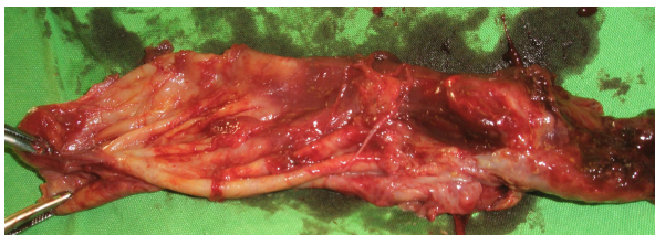
Figure 4 Intraoperative photo of the excised soft tissue lesion after en-bloc surgical excision.

In case of bony involvement, the disease has a high recurrence rate of 50%. It however, almost never recurs