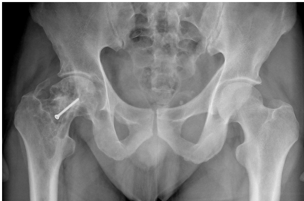
Figure 1 AP Pelvis radiograph showing a multicystic lesion in the right proximal femur with a cortical screw in situ.

is essential in determining the extent of bony disease, especially in the proximal femur. If hip replacement is necessary, the feasibility of using routine implants depends on the destruction of proximal femoral structures, best shown by a CT. If the calcar and/or the greater trochanter have to be sacrificed, the surgical plan (implant use, rehabilitation, potential outcome) changes. There were no other cysts visible.