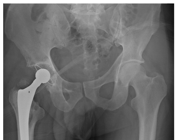
Figure 6 1 year postoperatively, the AP pelvic radiograph shows a well placed THR with no loosening.

Locally aggressive, benign bone tumors require specific techniques to avoid recurrence, thus the experience from their treatment can be used as an analogy for the treatment of musculoskeletal hydatidosis. Surgeons usually perform intralesional curettage, together with some form of adjuvant therapy (the use of intralesional curettage alone can be followed by a recurrence rate of up to 50%). The most commonly applied adjuvant therapies/procedures are cauterization, high-speed burring, exothermic cement polymerization and the use of