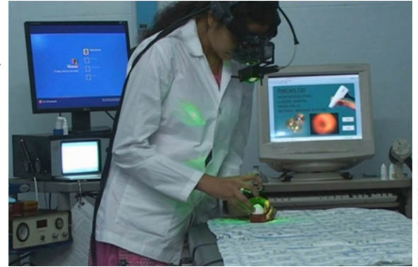
Figure 1 ROP trainee practising indirect laser on RetiEye.

Aravind Coimbatore was the first institute in India to get the RetCam 120 digital fundus imaging camera in 2003 and infra-red diode (810 nm) laser was also added in the following year. Use of intra-vitreous injection of anti-vascular endothelial growth factor (VEGF) was introduced in 2006. As the number of ROP cases increased over a period of time, a separate Paediatric Retina Clinic was inaugurated. A month-long ROP training programme was initiated, wherein candidates are trained to examine infants using indirect ophthalmoscopy and practice indirect laser on the RetiEye Model eye (AuroLab, Madurai, India) (Figure 1). So far 54 candidates from India and abroad have been trained