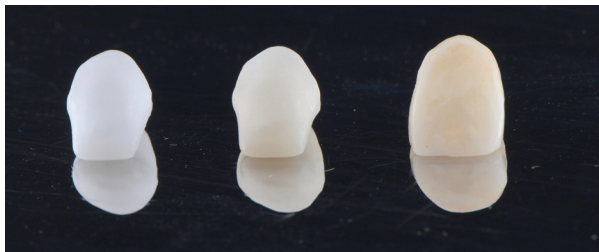
Fig. 1: Color measurement of colored Zr core on white background and color measurement of white Zr core on black background.

used for recording color coordinates (L,a,b) of each coping/crown (Fig. 2). Copings were cemented using silicone index for group WC and CC whereas for group MZ, body stains were used as external stains on crowns.