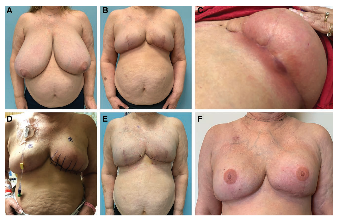
Fig. 3. Case 13. Preoperative photograph of a 51-year-old woman with left breast IDC (A). The patient underwent a unilateral kidney transplant over 20 years prior, and was on chronic immunosuppressants at the time of infection. She underwent a left therapeutic skin-reducing mastectomy and prophylactic right skin-reducing mastectomy with Ryan flaps and immediate placement of bilateral 800 cm<sup>3</sup> prepectoral tissue expanders in March 2019 (B). In June 2019 during adjuvant chemotherapy, she developed moderate to severe cellulitis of the left breast (C) and underwent immediate washout, removal of tissue expander, and placement of V.A.C. VERAFLO (D). After 4 days of IV antibiotic therapy and NPWTi-d with Prontosan, she underwent simultaneous bilateral breast reconstruction with permanent silicone gel implants (E, 11 days postoperative). She recovered well with no further issues and had nipple tattoos in January 2020 (F).

Of the 16 patients who presented with peri-prosthetic infection and underwent single application NPWTi-d, three presented with subpectoral implants. These subpectoral reconstructions were performed in 2016 and as recently as early 2017, after which both providers transitioned to prepectoral placement of implants. Our practice now exclusively performs prepectoral breast reconstruction. Additionally, the vast majority of our reconstructions are DTI with no need for interval tissue expanders and subsequent implant exchange. As such, our approach is quite different from other studies whose authors only report subpectoral reconstruction.<sup>15,16,29,30</sup> Some practices may be