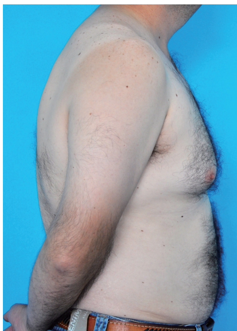
Fig. 1. Preoperative photograph with evident breast enlargement.

The histopathological analysis reported several samples in which stromal fibrosis with hyaline parts was found. Irregular ductal structures were identified, inlaid with hyperplastic epithelium following a