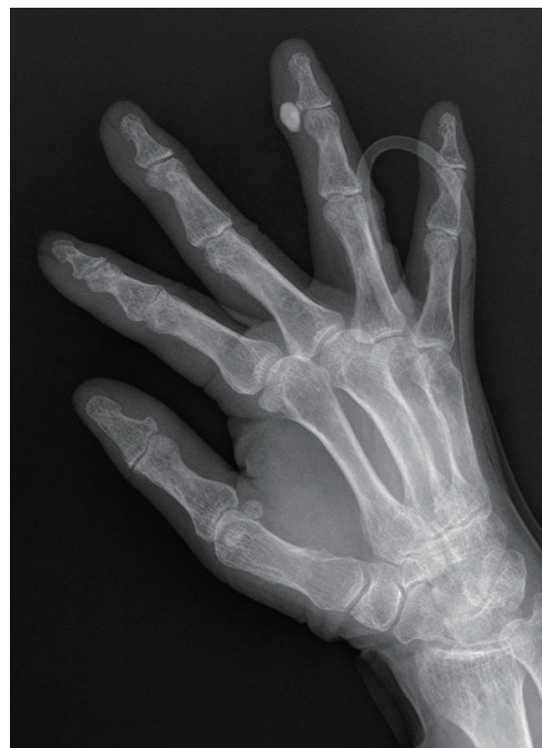
Fig. 1. The initial radiographs showed an ovoid calcification on the radial collateral ligament of the distal interphalangeal joint of the left fourth finger.

Acute calcific tendinitis is a form of acute inflammation of the tendon, causing severe pain, swelling, and limited joint motion, and is characterized by radiologic evidence of periarticular calcification. The pathogenesis is not clear, but some